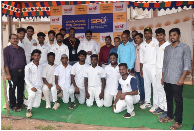
Inauguration of Sakshi Premier League Cricket Championship