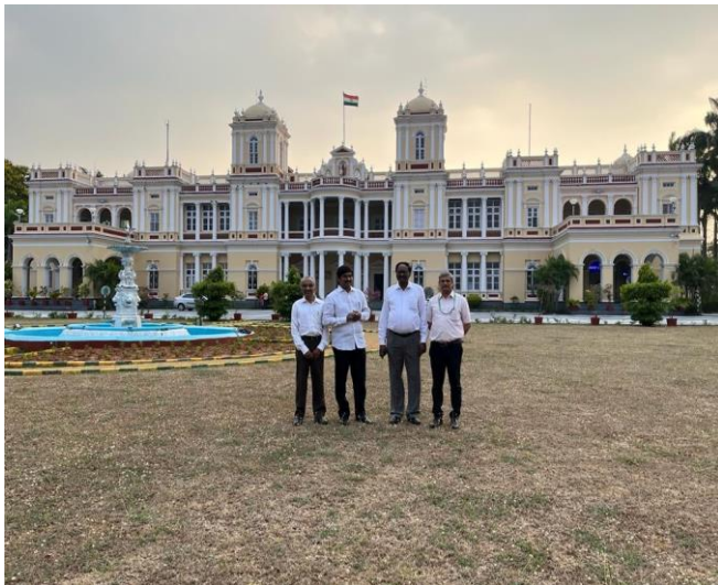
Visit to CFTRI, Mysore by Hon'ble VC and Registrar