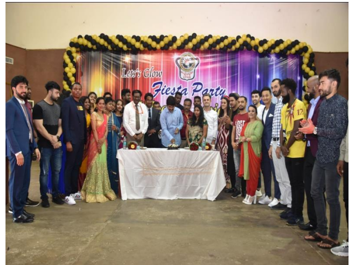
Fiesta Party organised by MBA students of Dept. of Commerce & Management Studies, A.U.