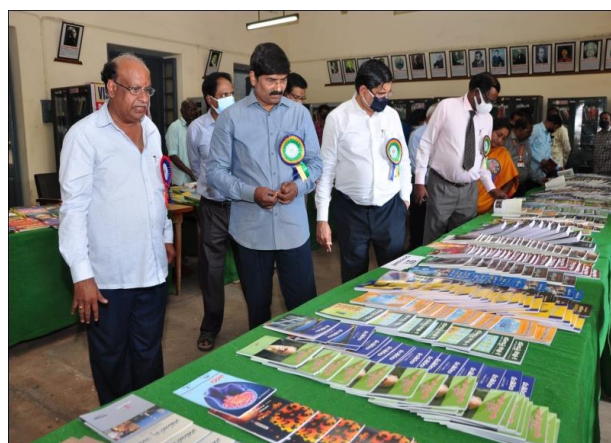
Science Day Celebration on the occasion of "Azadi Ka Amrit Mahotsav" – through Vigyan Vihar, Govt. of India – Book Exhibition @ Andhra University