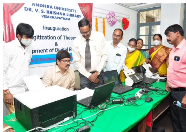
Digitization of Theses and Palm Scripts at Dr.V.S.K.Library