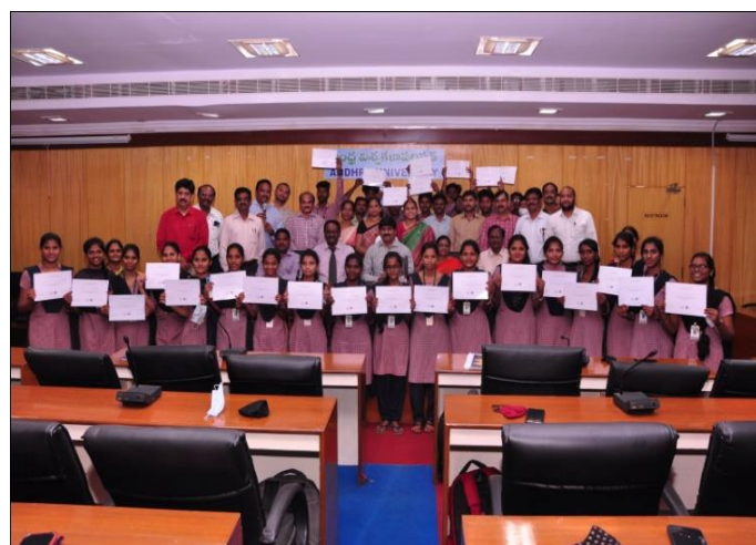
Dr. V.S. Krishna Govt. Degree College, upon "The Fundamentals of Digital Marketing" from Google Digital Unlocked, 2022.