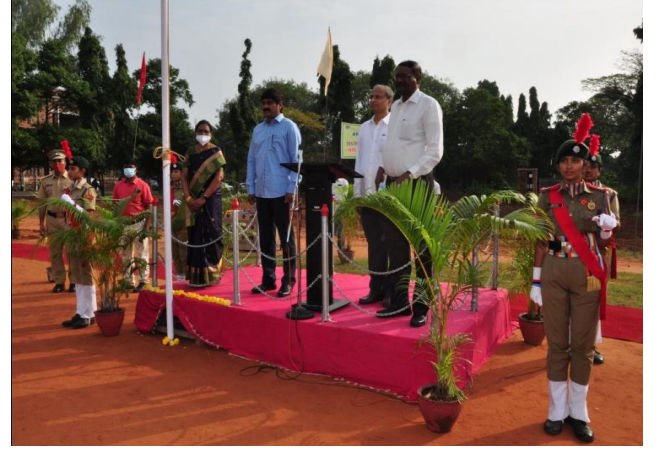
Republic day Celebrations

Namaste..... AU fraternity!!! Welcome to the year 2022. After COVID 19, this new year 2022 was welcomed with many new hopes and aspirations by all. The AU faculty and students celebrated Republic day with utmost respect towards our Nation. With all the support of our administrators SAMACHAAR successfully entered into 2 nd Volume from this issue.