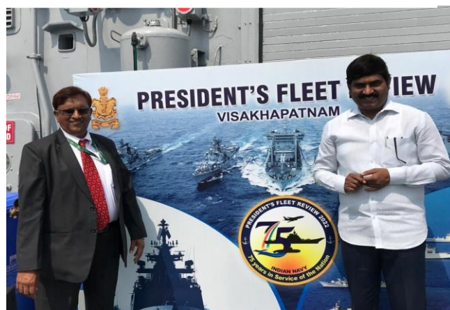
Onboard - President's Fleet review -2022