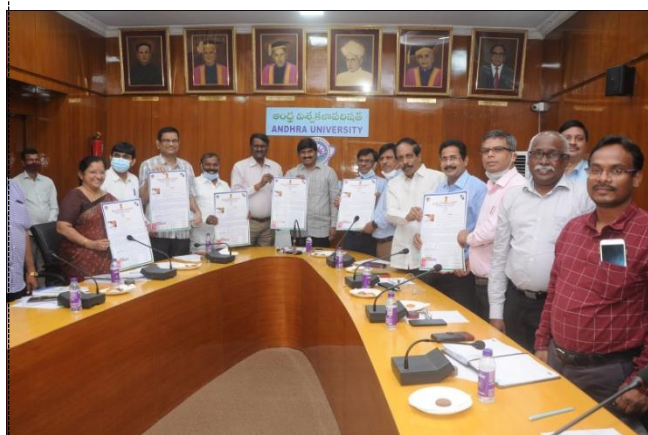
Poster Release – Science Day Celebrations (22nd - 28th February 2022) @ Andhra University