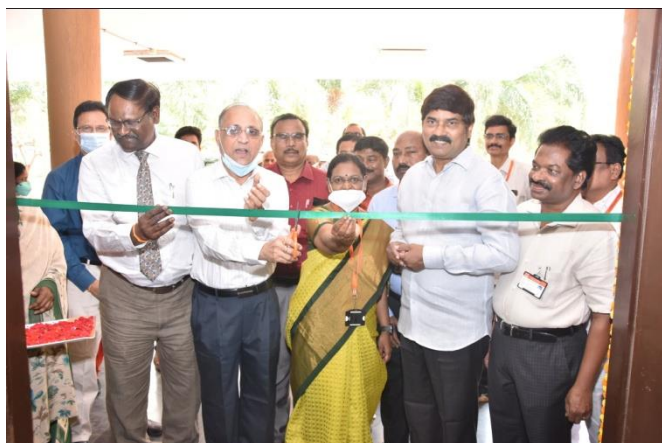
Inauguration of Office of the Convener, APICET 2022