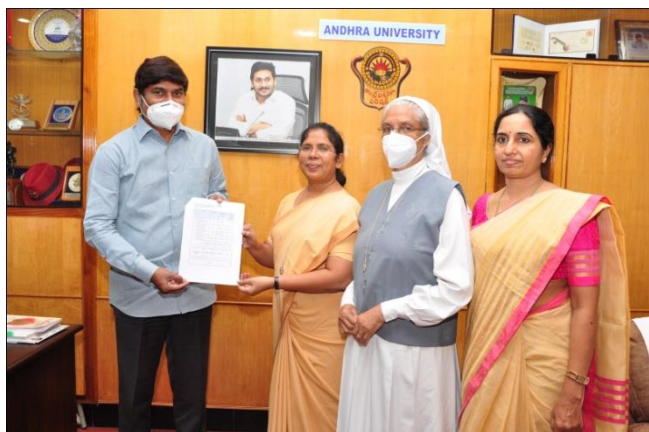
Congratulating to the Principal of St. Ann's college of women for securing A Grade in NAAC