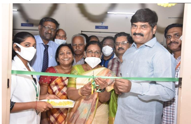
Medical Camp @ AU College of Pharmaceutical Sciences in association with Medicovert Hospitals, Visakhapatnam