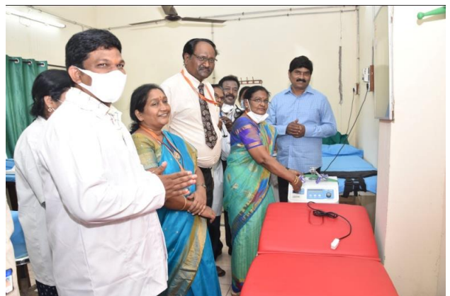
Inauguration of New Physiotherapy Equipment @ AU Health Centre