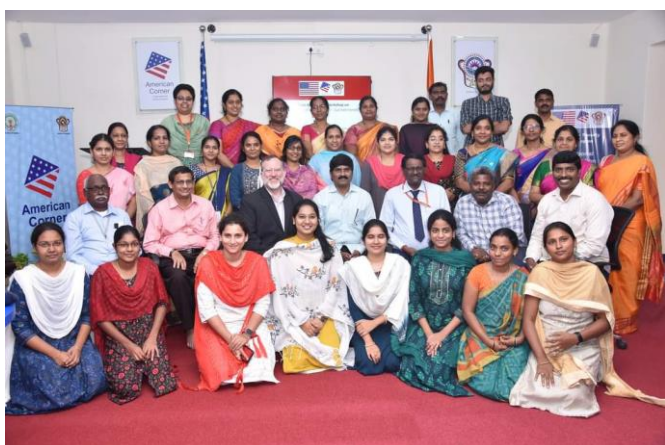
Two-day faculty workshop - American Corner on "International Collaboration Current Trends for young women faculty and researchers".