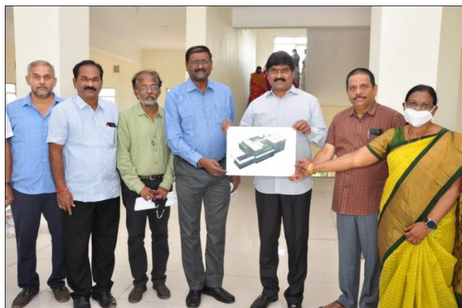
Skill Development & "Online Testing Centre" @ College of Engineering (A), AU.