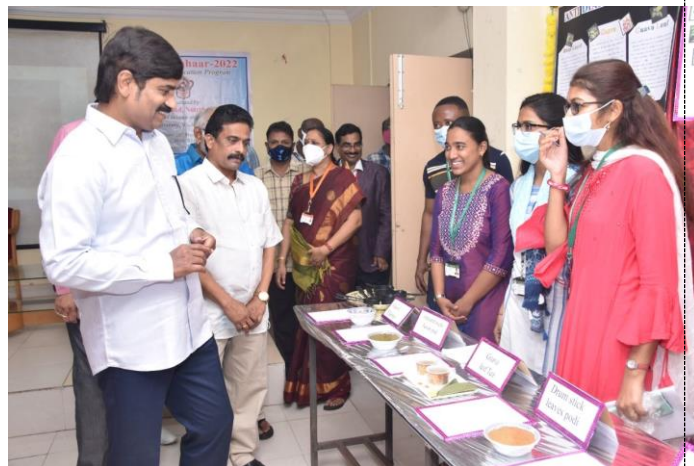
Inauguration - ‘Shreshta Aahaar 2022’ - Food Exhibition organised by Dept. of Food, Nutrition and Dietics, A.U.