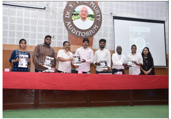
“AU United” Magazine Launch @ AU College of Engineering