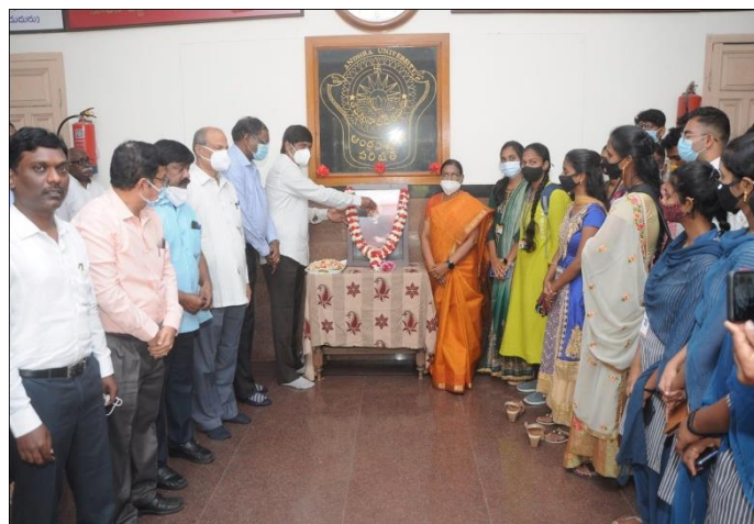
National Youth Day Celebrations