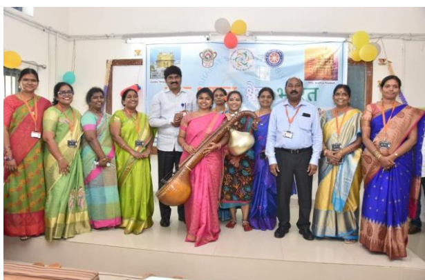
NSS Special Camp