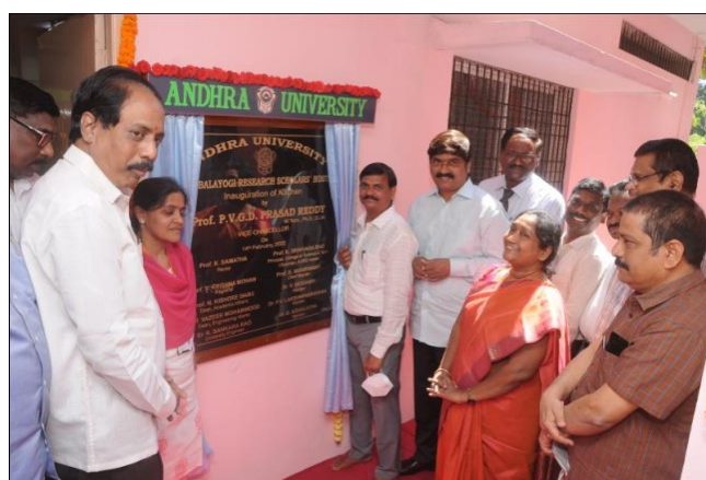
Inauguration of Kitchen @ GMC Balayogi Research Scholars' Hostel