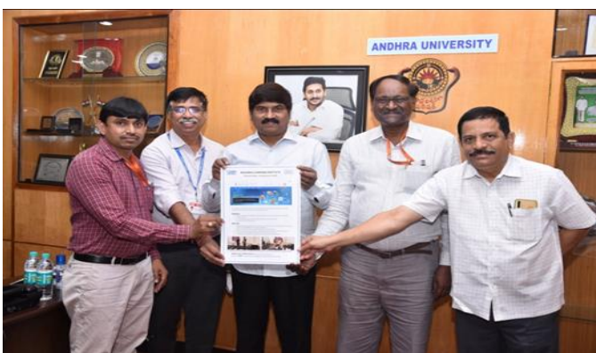
NTPC – NATS, National Apprenticeship Training Scheme to Graduate Engineers – Poster Launch