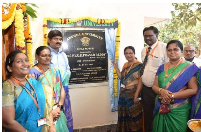
Inauguration of Girls Hostel, AU College of Engineering for Women