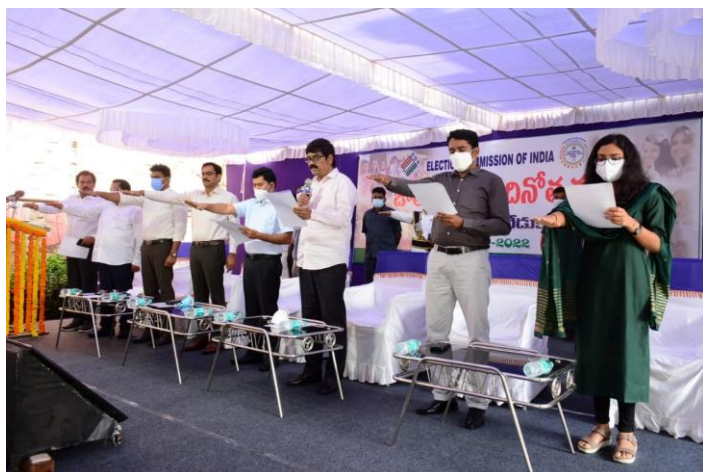
Hon'ble VC as Chief Guest during National Voter's Day