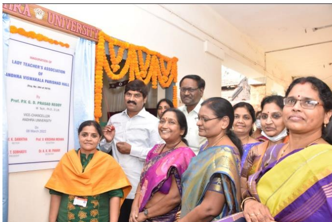
Inauguration of Lady Teacher's Association @ Andhra University – Faculty Club