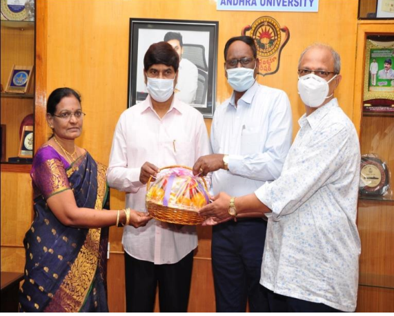
NEW YEAR CELEBRATIONS