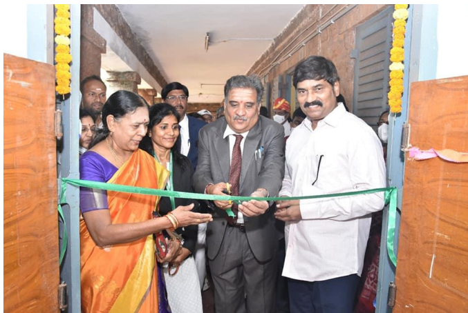
Inauguration of “Free Legal Aid Clinic” @ Dr. B.R. Ambedkar College of Law