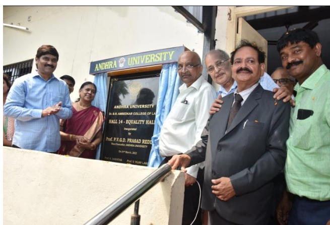
Inauguration – Hall-14 & 21 – Equality Hall @ Dr.B.R. Ambedkar College of Law, Andhra University