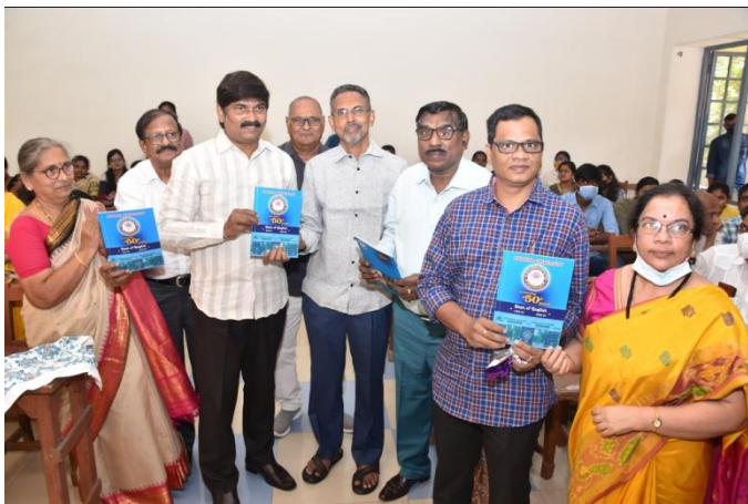
Golden Jubilee Reunion - M.A. English 1970-1972 Batch –@ Dept. of English, A.U.