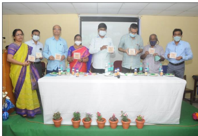
Inauguration of International Conference by Mathematics Department