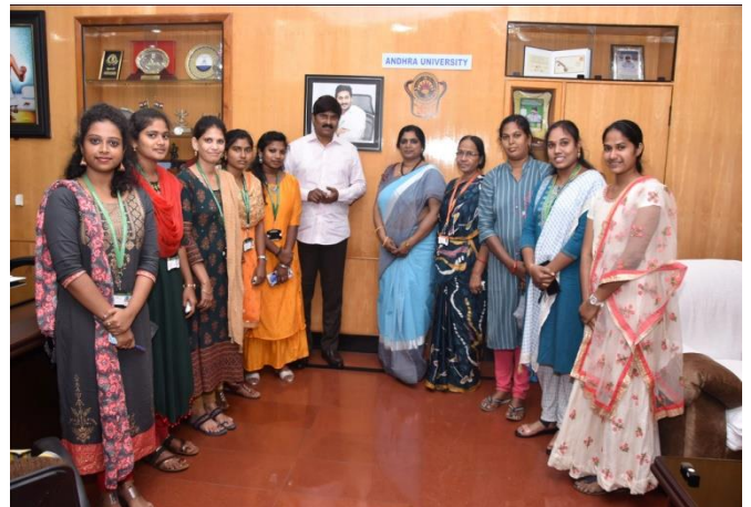
Participants from AU to National Women Parliament 2022 @ AP Women's Commission, ANU