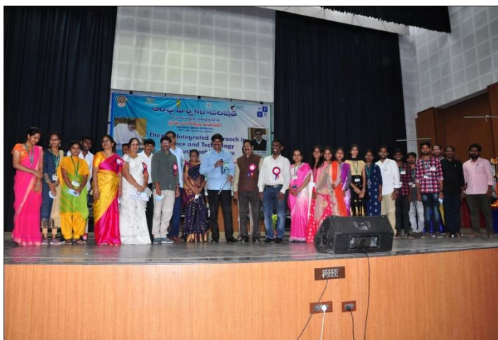
Award distribution to winners – Science Day Celebrations