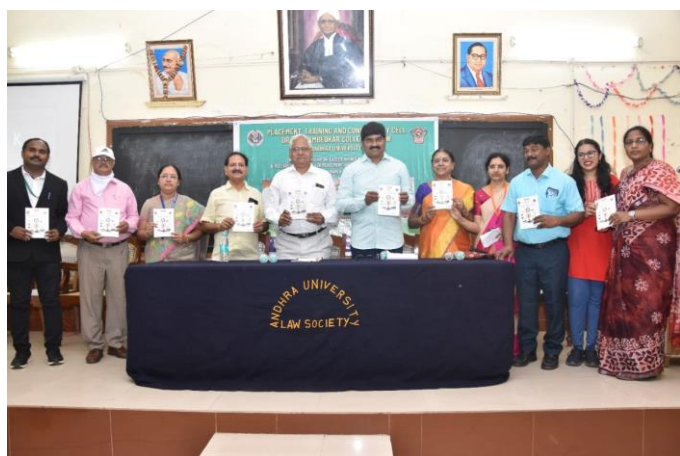
Inauguration of One Day Workshop on Career Avenues in Legal Field & Release of Rulebook for Placement, Moot & Internship Committees” @ Dr. B.R. Ambedkar College of Law