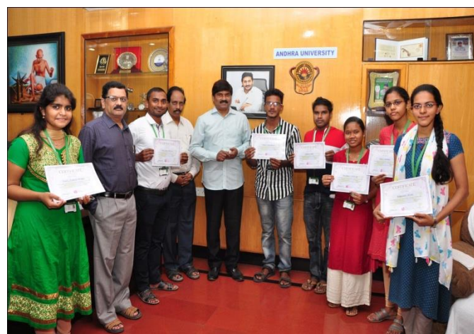
A.U. College of Pharmacy, obtaining SAKURA SCIENCE Exchange Certificates from Japan Science and Technology Agency – conducted by Toyamo Prefecture.