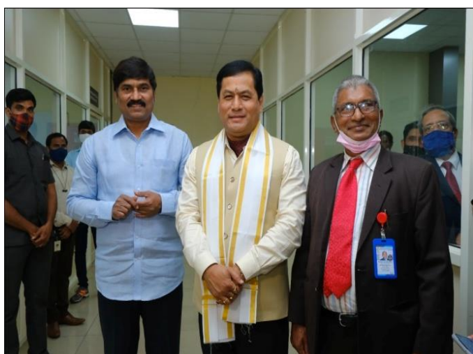
CoE in Maritime & Shipbuilding by Shri Sarbananda Sonowal, Hon'ble Union Cabinet Minister, Ministry of Ports, Shipping and Waterways & Ministry of Ayush