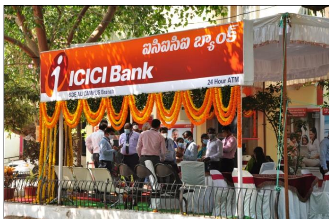
ICICI Bank, SDE Branch, A.U.