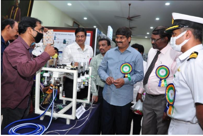
Science Day Celebration – Industrial Expo @ Andhra University