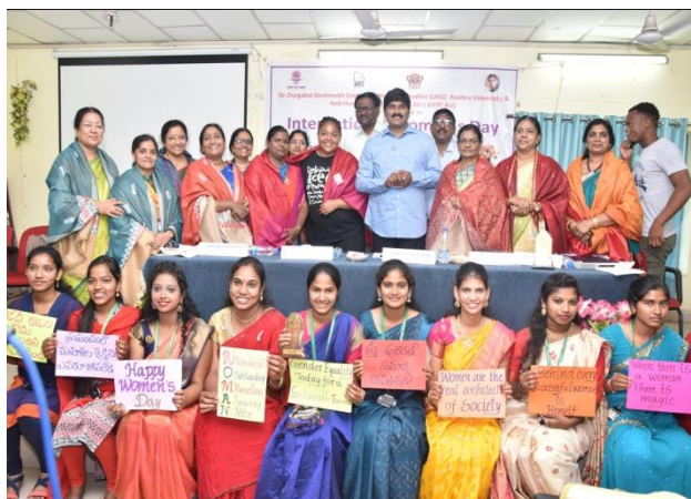
International Women's Day Celebrations @ Dr. Durgabai Deshmukh Centre for Women's Studies, Andhra University – Theme Gender Quality Today for a Sustainable Tomorrow