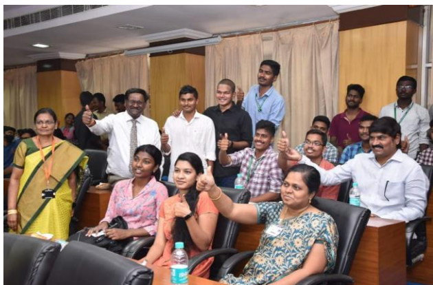
A.U. Campus Placements - Distribution of offer letters to students