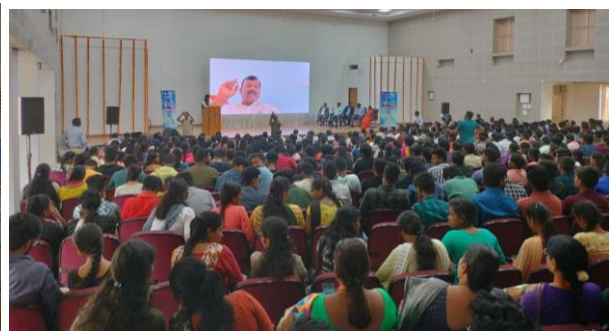
Minister of State for Social Justice & Empowerment, Govt. of India addressing the gathering - Online