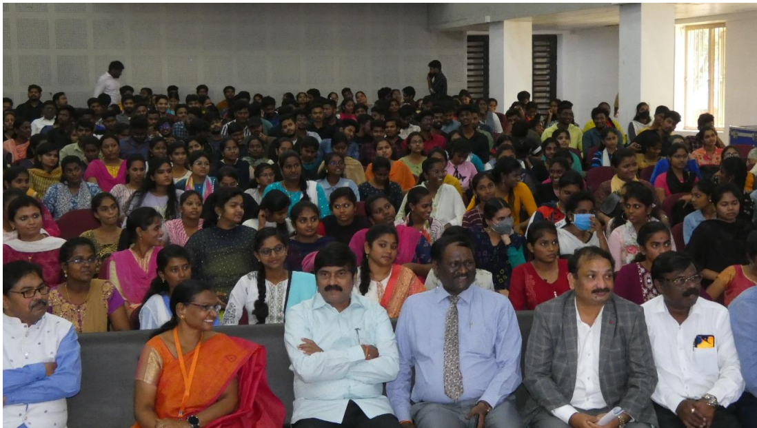
Guests in the first row (Left to Right): The IPR Chair, Govt. of India, Rector of A.U. , Hon'ble Vice-chancellor of A.U. , Registrar of A.U. , Additional Director & OIC, Software Technology Part of India (STPI), Ministry of Electronics & Information Technology, Govt. of India, HoD, Computer Science.

The Meeting started with a special song by the students and a SKIT / DRAMA performance from the students of Andhra University portraying the empowerment of a Dalit student using the digital services available, which received a tremendous response from the participants.