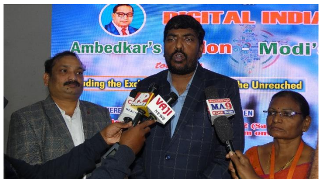
Chair Professor addressing the press in the presence of Rector & STPI Adl. Director