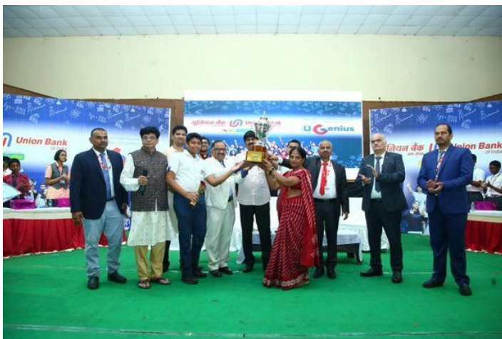
Prize Distribution Ceremony of 'U Genius' – National level General Awareness Quiz Competition 2022 organized by Union Bank of India, Visakhapatnam