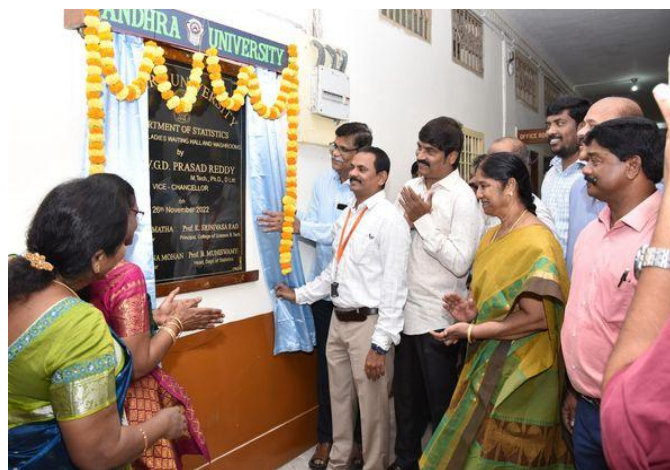
2. Ladies Waiting Hall and Restrooms at Dept. Of Statistics, A.U.