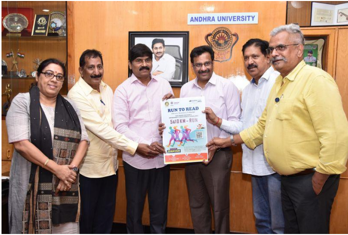
Poster Release - 'Run To Read' – 5 & 10 KM Run - Literacy Awareness Campaign on 11-12-2022 – organizing by Rotary International and Rotary Institute 2022