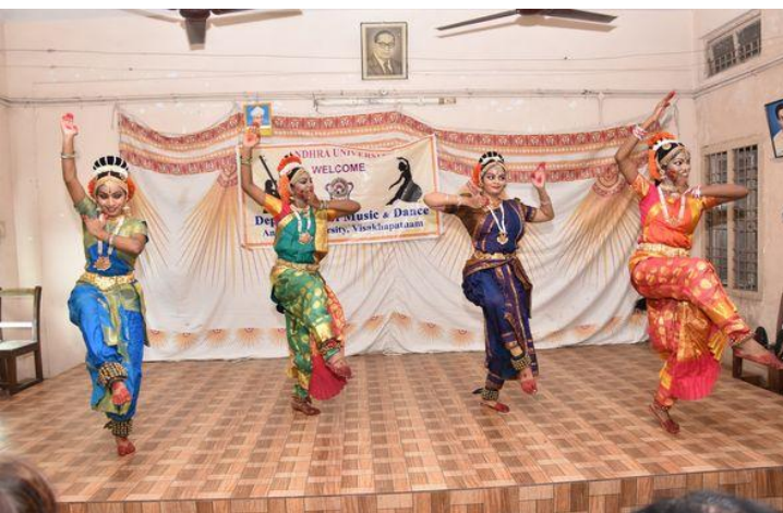
Dance Concert at the Department of Music & Dance, Andhra University on the occasion of Birth celebrations of Kuchipudi Dance Legend 'Padmabhushan' late Shri Vempati Chinna Satyam