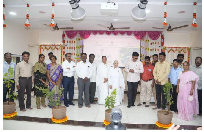
Launch of Kalpataruh Project @ Andhra University in collaboration with Govt. of AP (BCDE) & Brahma Kumaris