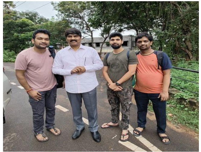
2. B.Tech (CSE) 2004-2008 batch