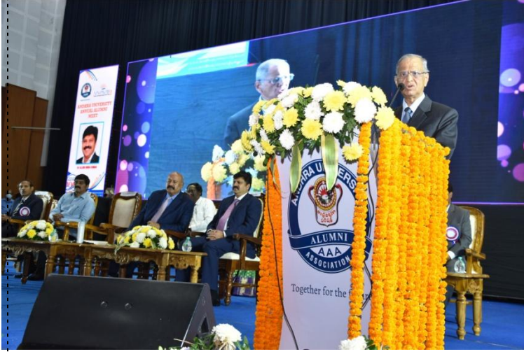
'WAVES – 2022' - Andhra University Alumni Meet – Shri N.R. Narayana Murthy, Founder of Infosys graced the event as the Chief Guest