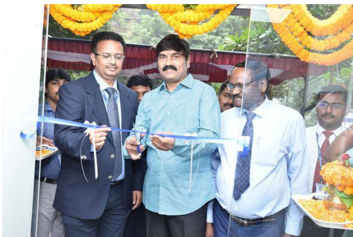
1. HDFC Bank at Andhra Univeristy