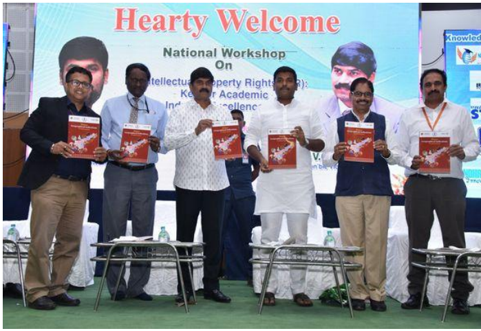
National workshop on 'Intellectual Property Rights (IPR) : Key for Academic & Industry Excellence in AP' @ Andhra University – Jointly organized by Andhra University, Department for Promotion of Industry and Internal Trade, a-HUB & Institution's Innovation Council