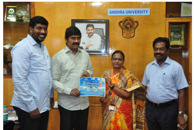
Brochure Release – Seminar on 'Digital India: Ambedkar's Vision – Modi's Provision' on 03-12-2022