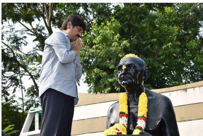
1. Tribute to Mahatma Gandhi