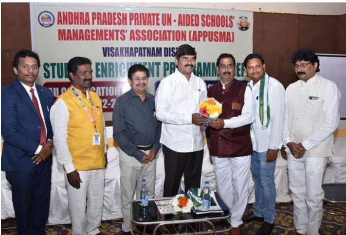
Student Enrichment Program (SEP) - organised by the Andhra Pradesh Private Un-aided Schools' Managements' Association (APPUSMA), Visakhapatnam District at AU Convocation Theatre