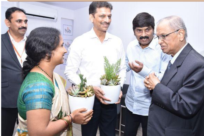
Visit of Shri N.R. Narayana Murthy, Founder of Infosys to AU Incubation Hub – in the presence of Dr. G.M. Rao, Chairman, GMR Group & Chairman,