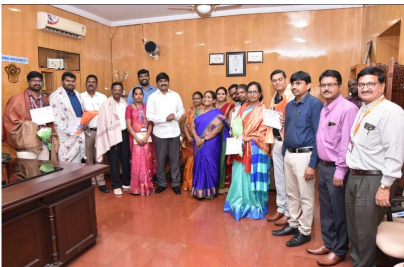
Under Unnat Bharat Abhiyan (UBA) Programme the Certificates were distributed to the regional coordinators and Institutions for exhibiting merit performance by Hon'ble Vice-Chancellor