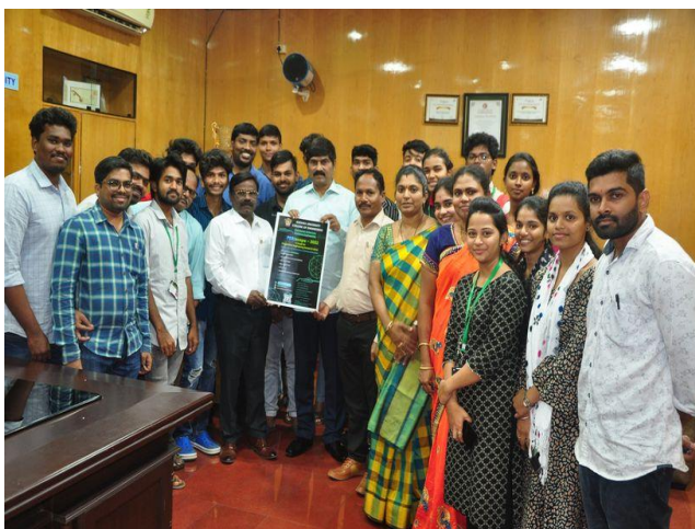
Poster & Brochure Release – 'PERIScope – 2022' – A Two-day National Conference @ Dept. of Computer Science & Systems Engineering, AU College of Engineering – Dec 30-31, 2022