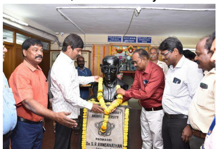
National Library Week – 2022' Celebrations at Dr. V.S. Krishna Library, Andhra University