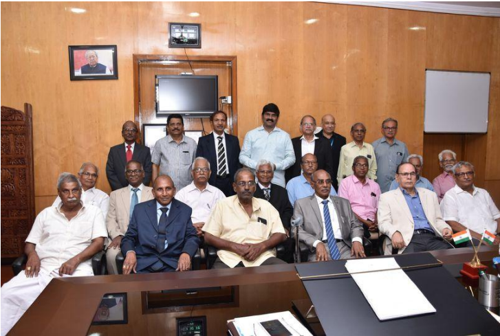
26. Golden Jubilee Celebrations of Alumni Batch (B.Tech Mechanical Engineering 1968-1972)