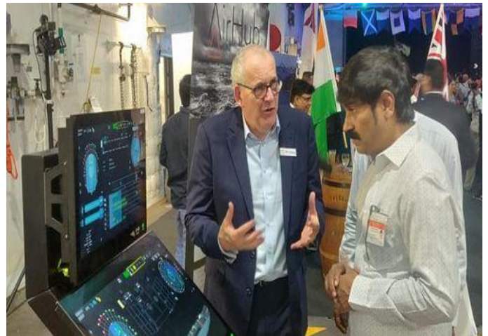
At Indo-pacific endeavor 2022, Reception on board HMAS Adelaide, Australian Flagship regional engagement activity @ Visakhapatnam Port Trust