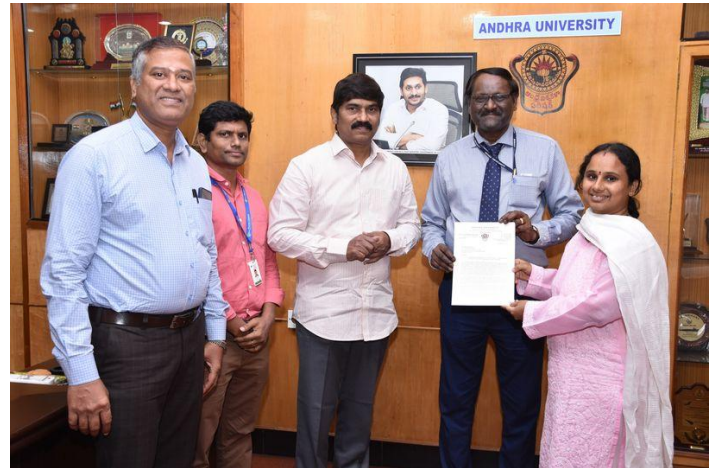
Establishment of 'LEE PHARMA Chair Professor' by M/s. Lee Pharma Ltd., Hyderabad @ Andhra University – Sanctioned under Industry-Academia Collaboration