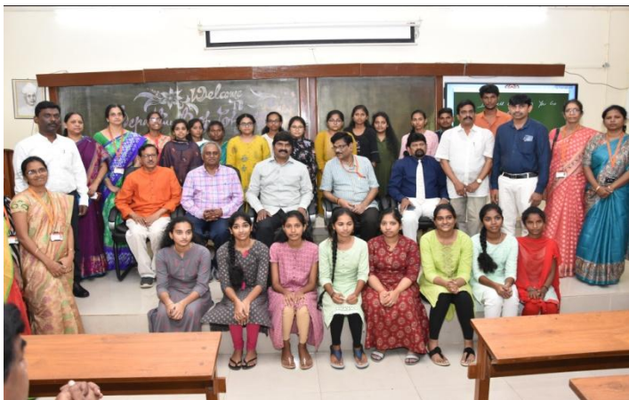
Inauguration of Internship & Entrepreneurship embedded -Food Science & Technology Programme @ Dept. of Chemistry, Andhra University, leading to 4 Years B.Sc (Hons) + 1 Year M.Sc., Multi Entry & Exit Scheme.