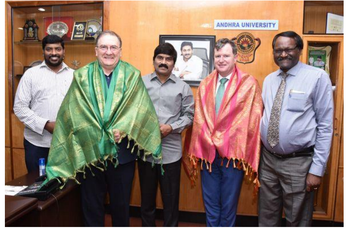
31. Mr. Malcolm Byrne, Senator, Senate of Ireland