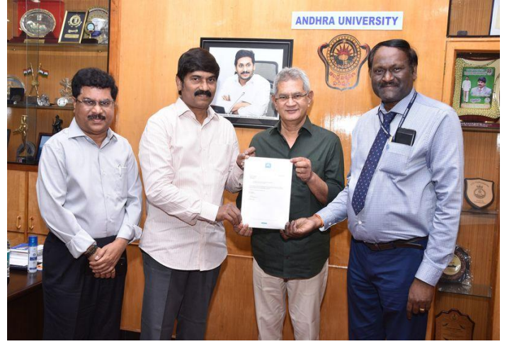
Establishment of 'SMT. SHEIK SYDOON MASUMA BEGAM Chair Professor' by M/s. MAP AVENUES, Visakhapatnam @ Andhra University – Sanctioned under Industry-Academia Collaboration