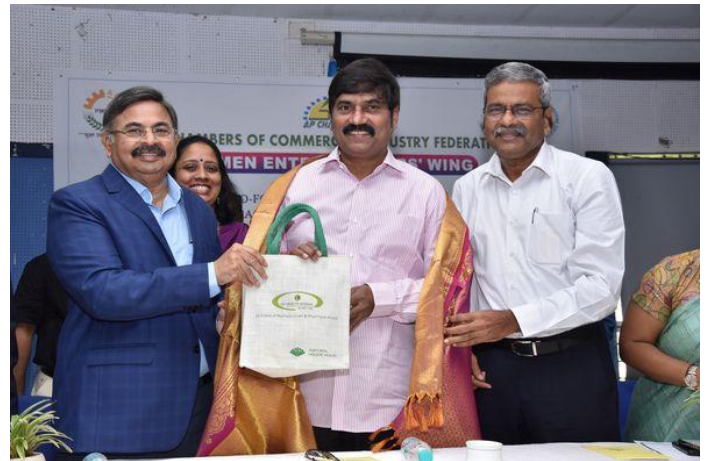
Inaugurated the Seminar on 'Agro-Food Processing Exports from Andhra Pradesh – Growth Opportunities' organised by AP Chambers of Commerce & Industry Federation