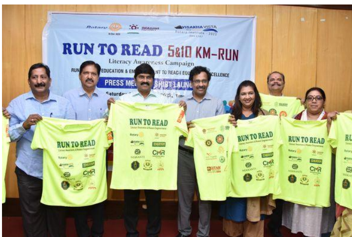
'Run to Read' – 5 & 10 KM – Run - Literacy Awareness & Women Empowerment Campaign – Organising by Rotary, Visakhapatnam - Press Meet & T-Shirt Launch