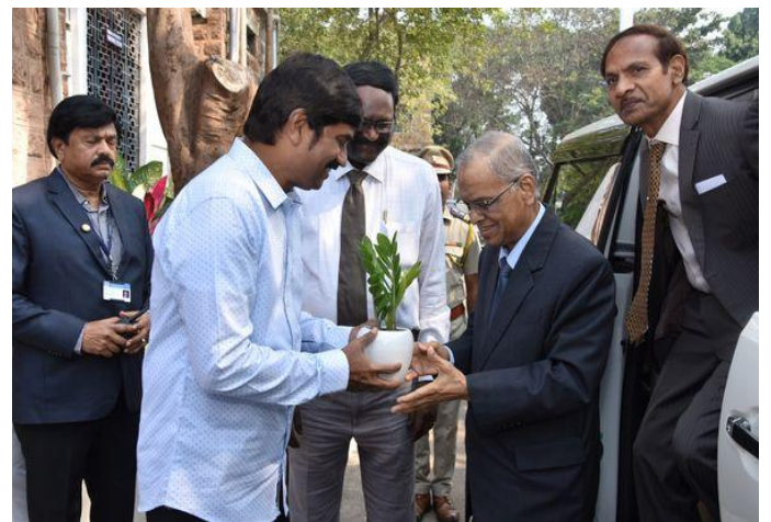
33. Shri N.R. Narayana Murthy, Founder of Infosys to Andhra University.