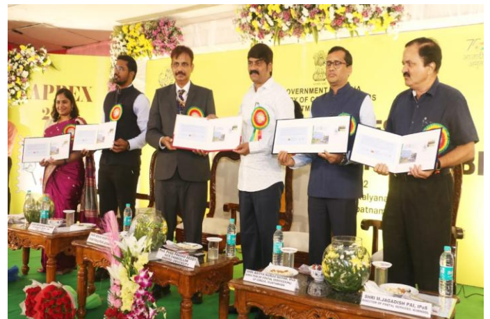
Inauguration - Andhra Pradesh State Level Philatelic Exhibition organised by Department of Post, Govt. of India