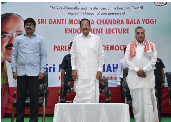
Sri GMC Bala Yogi Endowment Lecture @ Andhra University delivered by Shri M. Venkaiah Naidu, Hon'ble former Vice-President of India