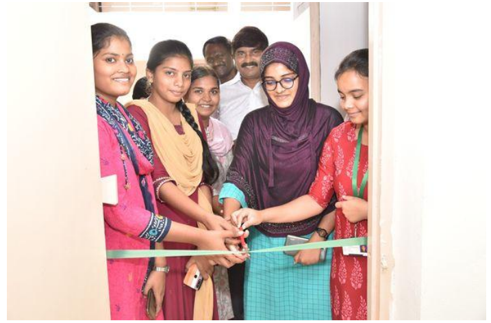
4. SALPG Hostel, Individual Rooms inauguration by students of the college