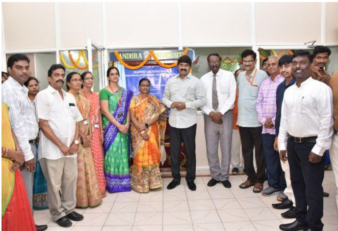
5. Alumni Lecture Hall at Dept. of Chemistry, (Alumnae 1976-82)