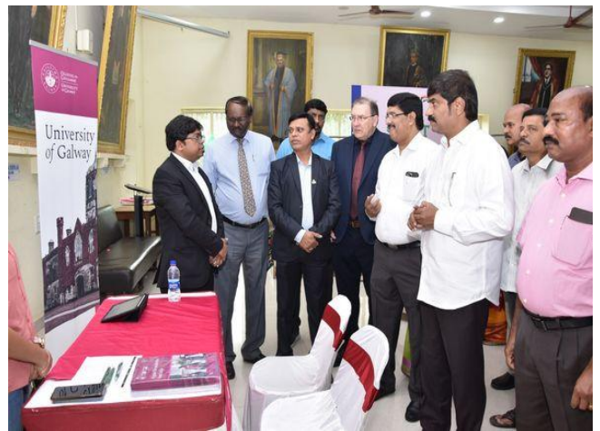
Inauguration of Ireland Education Fair at Andhra University - organised by the i-20fever team of Yathapu Consulting Pvt. Ltd.,