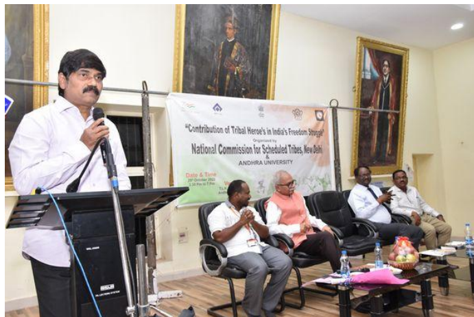
"Contribution of Tribal Heros' in India's Freedom Struggle" Programme under the initiative of 'Azadi Ka Amrit Mahotsav' jointly organized by Andhra University & National Commission for Scheduled Tribes, New Delhi