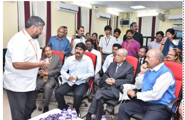
6. 'Digital Photogrammetry Lab' at AU College of Engineering