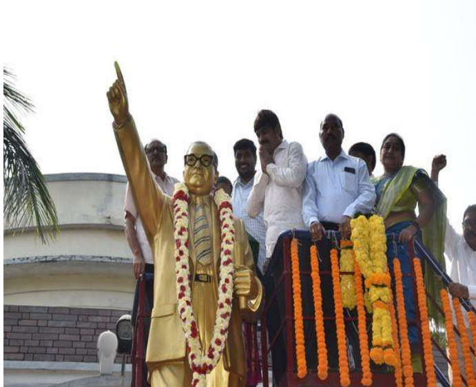
73rd Constitution Day Celebrations at Central Administrative Office, Andhra University on 26 th November 2022.