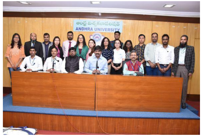
Technical & Educational Visit to Andhra University - 26th Batch of PG Course participants of RS & GIS course of Centre for Space Science and Technology Education in Asia Pacific (CSSTEAP),