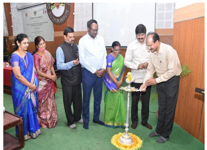
National Seminar on NEP 2020 – Implementation Strategies for Quality Enhancement - Organized by Internal Quality Assurance Cell, Andhra University