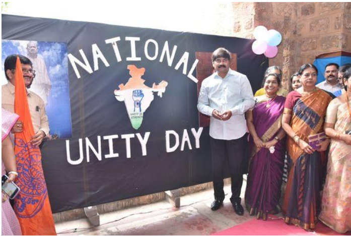
National Unity Day Celebrations @ Dr. B.R. Ambedkar AU College of Law, Andhra University on the occasion of the 147th Birth Anniversary of Iron Man of India, Shri Sardar Vallabhbai Patel