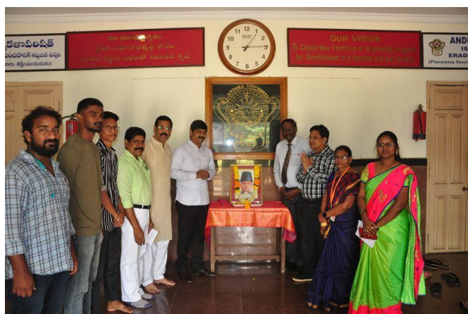
2. Maulana Abul Kalam Azad