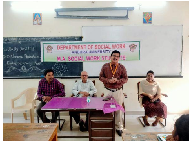
Awareness Programme on Child Rights Protection organised by Bala Vikas Foundation, Visakhapatnam in association with Andhra University @ Department of Social work, Andhra University