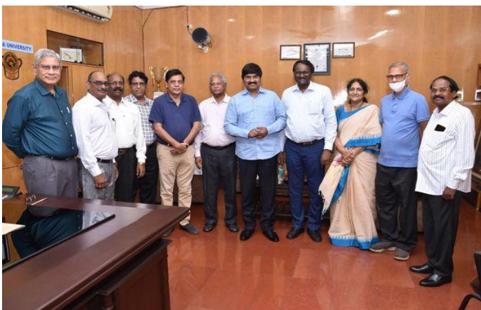
28. Visit of Alumni (MBA - 1979-1981 Batch)