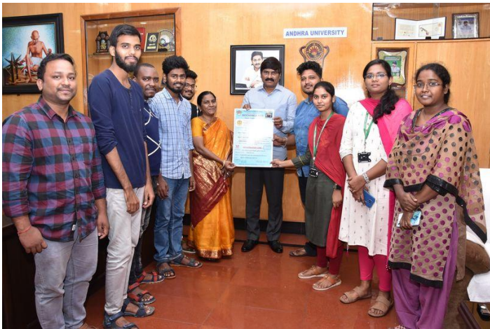
Poster Release – 'BIOCHIMICA 2K22' – Science Fest by the Dept. of Biochemistry, Andhra University