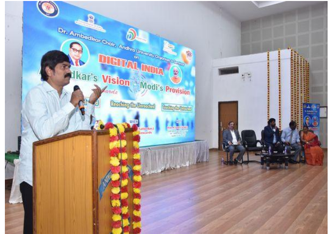
Inauguration of Seminar on 'Digital India: Ambedkar's Vision - Modi's Provision' - organised by Dr. Ambedkar Chair, Andhra University