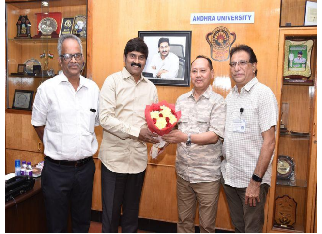
25. Lt. Col. Doshehe Y. Sema (Retd.), Former Minister, Govt. of Nagaland