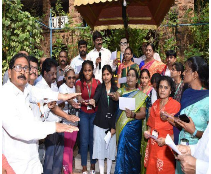
Constitution Day Celebrations at Dr.B.R. Ambedkar college of Law, Andhra University