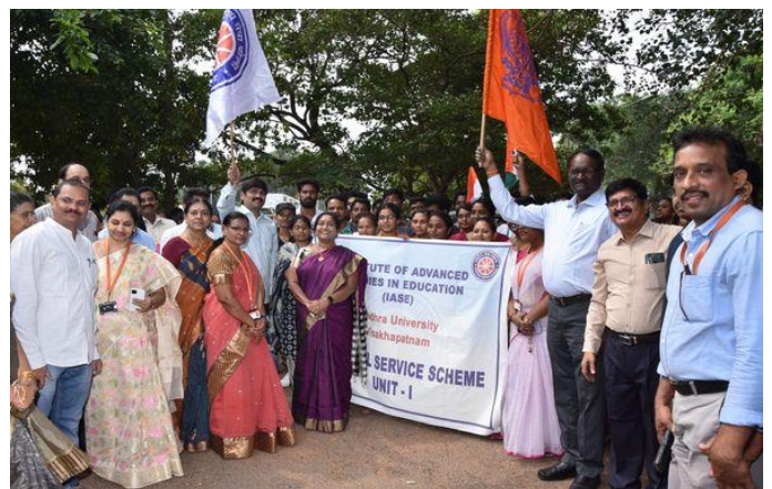
Flag-off the Rally - National Unity Day Celebrations @ Andhra University on the occasion of the 147th Birth Anniversary of Iron Man of India, Shri Sardar Vallabhbhai Patel