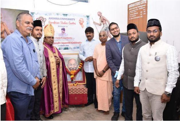
Mahatma Gandhi's Jayanti Celebrations at Gandhian Studies Centre, A.U

Namaste AU fraternity!!! During this quarter Andhra University celebrated and participated in many events