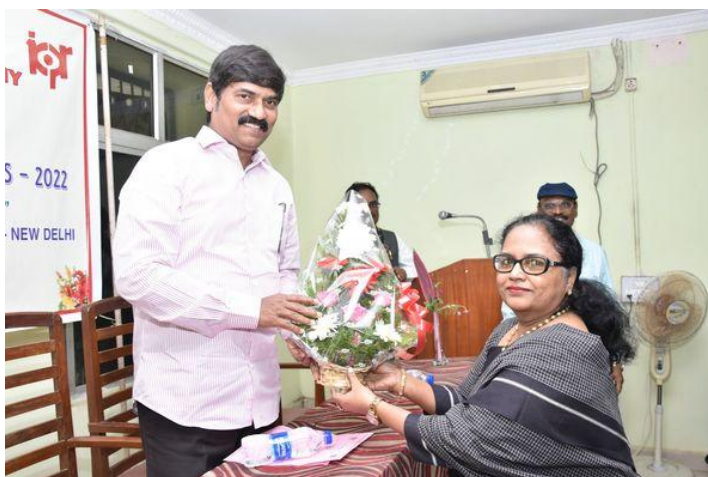
World Philosophy Day Celebrations 2022 at Department of Philosophy, Andhra University in association with Indian Council of Philosophical Research, New Delhi