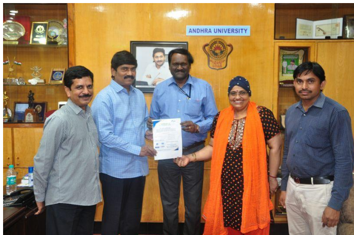
Achieved 7 STAR Rating in Environment Audit - Assessed in accordance with the standards set by the Ministry of Environment, Forest and Climate Change (MoEF & CC) and Central Pollution Control Board (CPCB) – Honourable Vice-Chancellor and Registrar appreciated the IQAC Team.