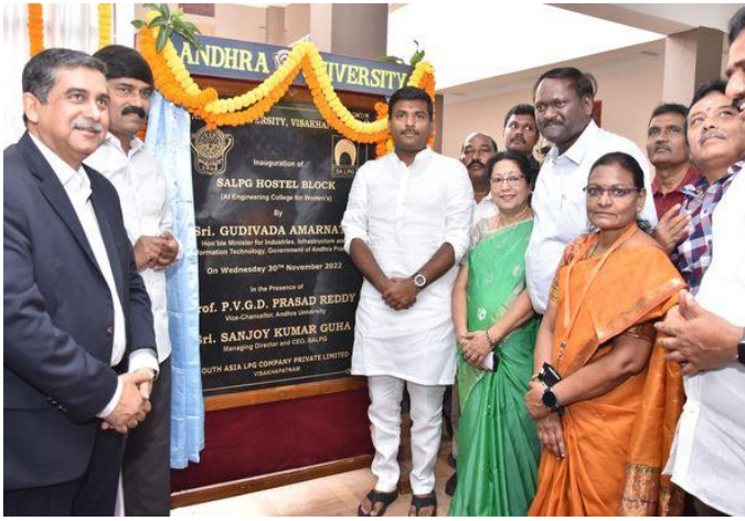
3. Inauguration of SALPG Hostel Block at AU College of Engineering for Women by Hon'ble Minister Sri Gudivada Amarnath – CSR Initiative by South Asia LPG Company Pvt. Ltd.