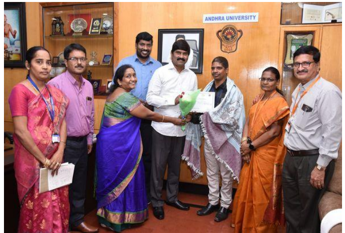
Unnat Bharat Abhiyan (UBA) Programme – Certificates Distribution Ceremony for rendering merit – AU Regional Coordinate Institutions.