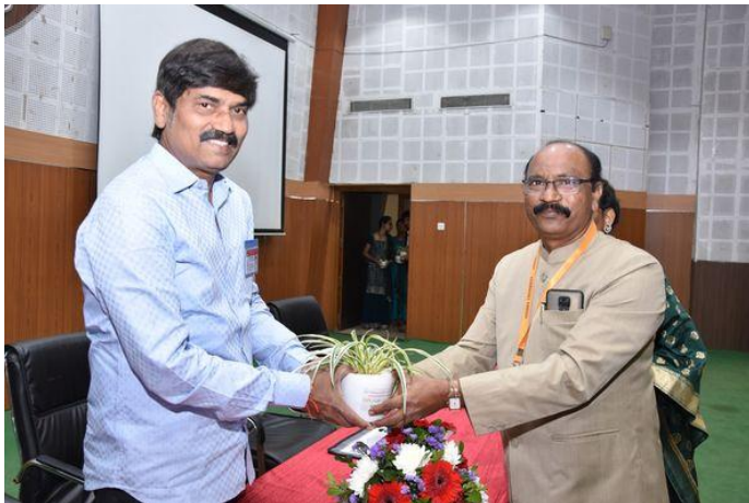
International GIS Day – 2022 - Workshop on 'GIS for Green Life' @ Andhra University in association with Indian Society of Geomatics, Visakhapatnam Chapter