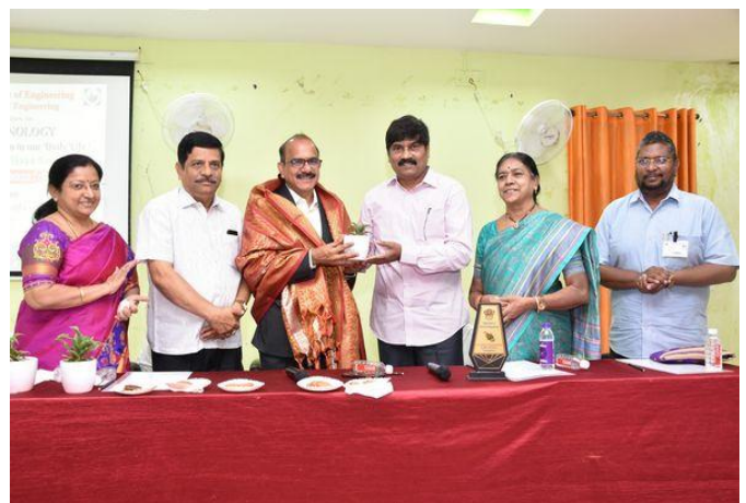
One Day Programme on 'Space Technology – Development & Application in our Daily life' @ Department of Electrical Engineering, AU