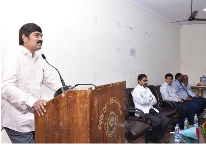
Visakha Life Sciences & Entrepreneurship (VLSE) Symposium 2022 @ Dept. of Zoology, Andhra University