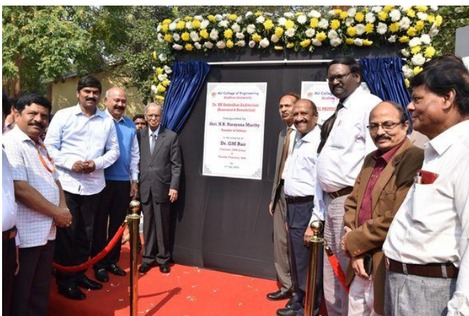
7. Renovated and Remodeled 'Dr. B.R. Ambedkar Auditorium' at AU College of Engineering.