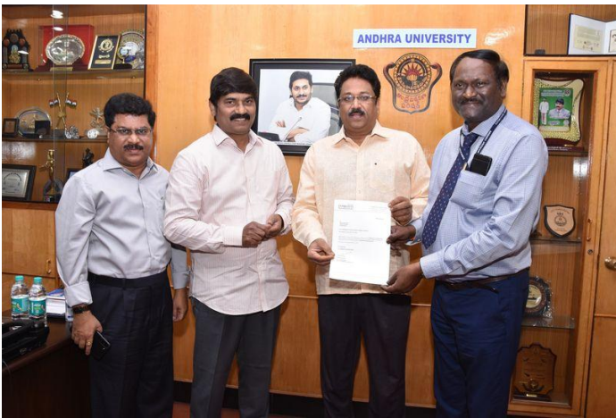
Establishment of 'SYMBIOSYS TECHNOLOGIES Chair Professor' by M/s. Symbiosys Technologies, Visakhapatnam @ Andhra University – Sanctioned under Industry-Academia Collaboration