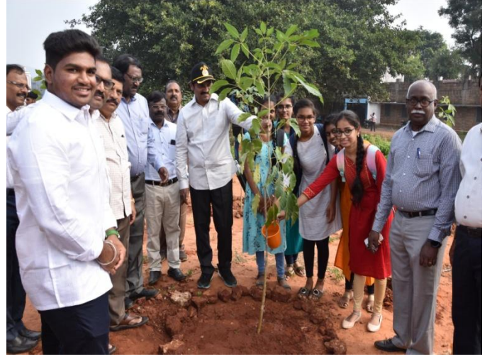
'జగనన్న పచ్చతోరణం' - Plantation Programme @ AU grounds organised by the NSS Unit and Sanitation and Beautification Unit, Andhra University in association with the Forest Department, Govt. of AP