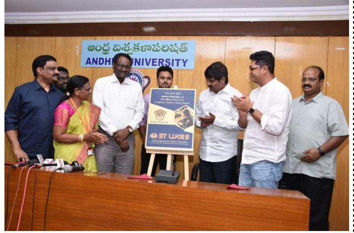
Launch of Certificate course in Audio & Music @ Andhra University under MoU with St. Lukes Audio Engineering & Music Production