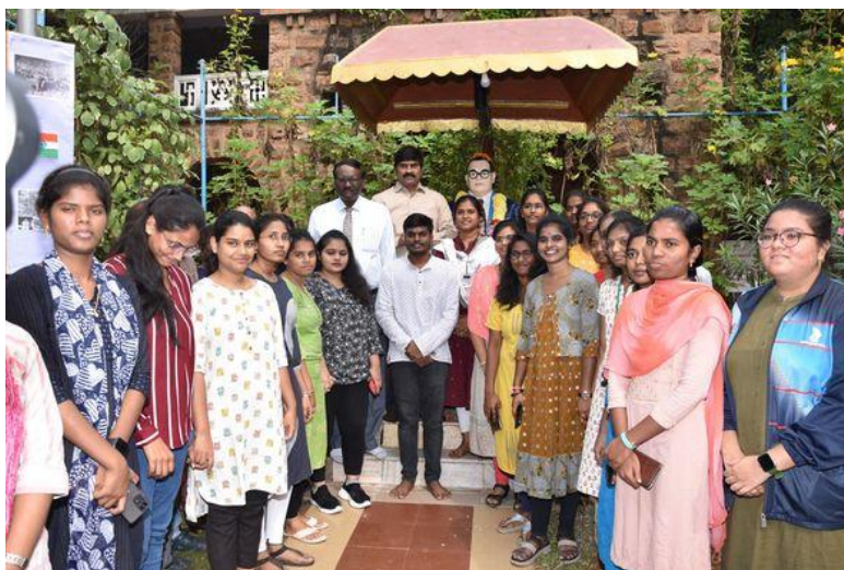
3. Dr. B.R. Ambedkar