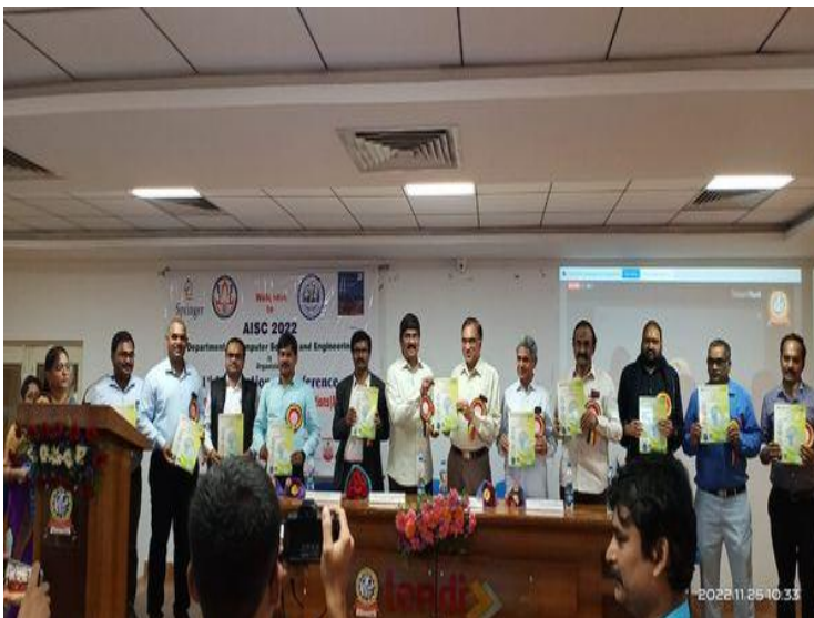
Inauguration – 1st International Conference on Artificial Intelligence, Security and Communications (AISC) 2022 organised by Dept. of Computer Science & Systems Engineering @ Lendi Institute of Engineering, Visakhapatnam