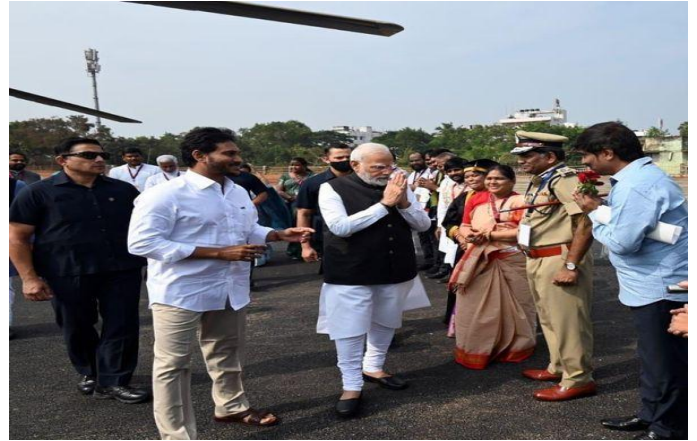
Honoured and delighted to Receive and welcome the Hon'ble Prime Minister of India, Shri Narendra Modi Ji, and Hon'ble CM of AP Shri Y.S. Jagan Mohan Reddy Ji at "Andhra University new Helipad Ground" on 12th November 2022.