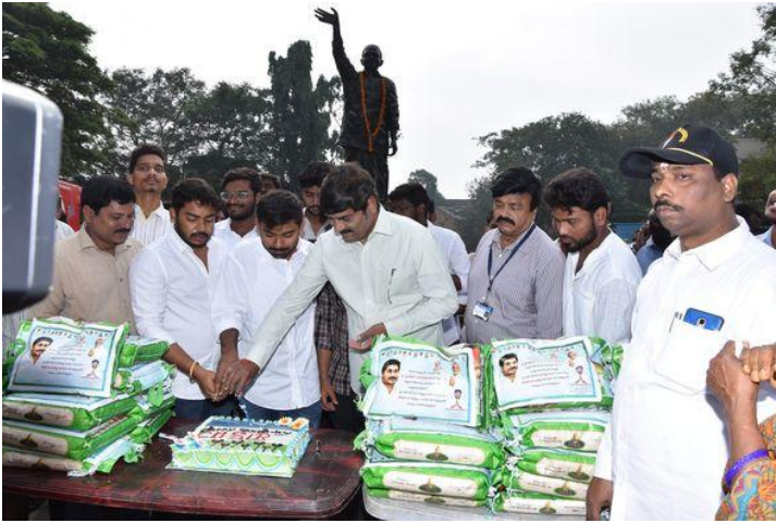
Birthday Celebrations of Hon'ble Chief Minister of Andhra Pradesh, Shri Y.S. Jagan Mohan Reddy garu @ Andhra University – Distribution of Rice Bags by the students